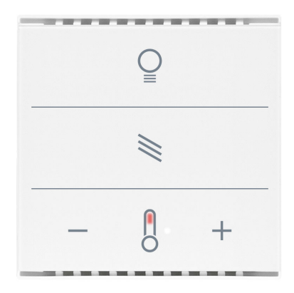
Cala KNX MultiTouch T Light/Sunblind CH Item numbers 70891 (white), 70893 (black)