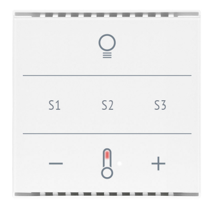
Cala KNX MultiTouch T Light/Scenes CH Item numbers 70961 (white), 70963 (black)