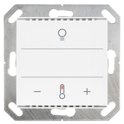
Cala KNX Multitouch T Light Item numbers 70950 (white), 70952 (black)