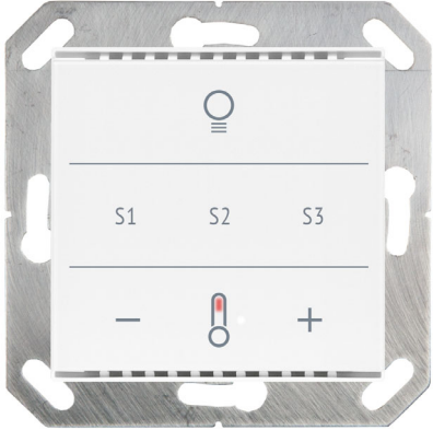
Cala KNX Multitouch T Light/Scenes Item numbers 70960 (white), 70962 (black)