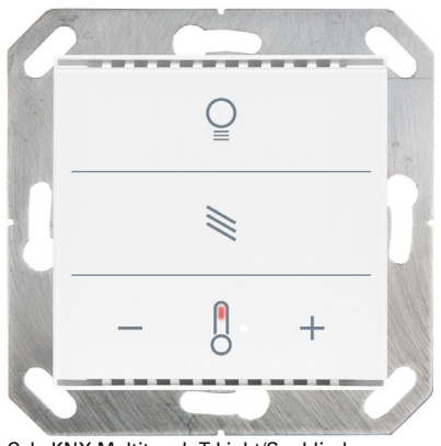
Cala KNX Multitouch T Light/Sunblind Item numbers 70890 (white), 70892 (black)